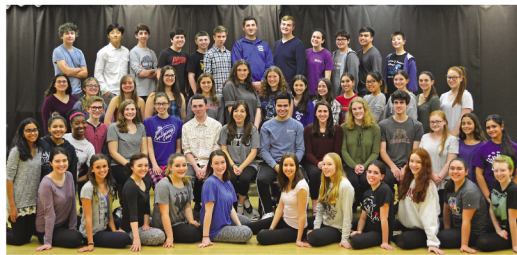
Cast of the Schreiber Theatre Company's production of "Crazy About You."